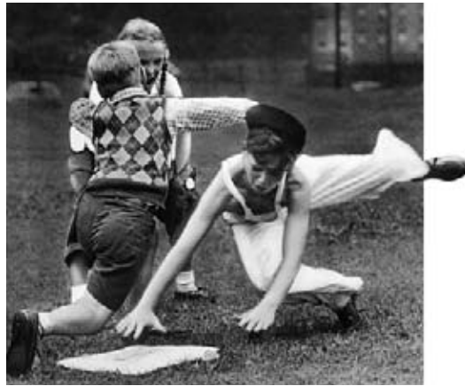
Kids play a pickup game of baseball.

Families living on farms set aside land for a baseball diamond. City kids played stickball in the streets, using broomsticks for bats and mailboxes or trees for the bases. Vacant lots were turned into playing fields. Winning was great, but the joy of playing a sport with your friends was just as important. Playing baseball was fun, but it was not very well organized .