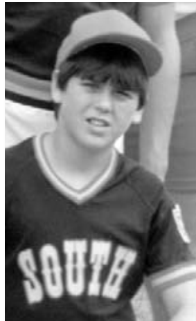
Jason Varitek, Boston Red Sox catcher

Chris Drury (1989), Stephane Matteau (1982), Pierre Turgeon (1982), and Ray Ferraro (1976) have played hockey in the National Hockey League. Brian Sipe, a former Cleveland Browns quarterback, played in the 1961 Little League Baseball World Series.