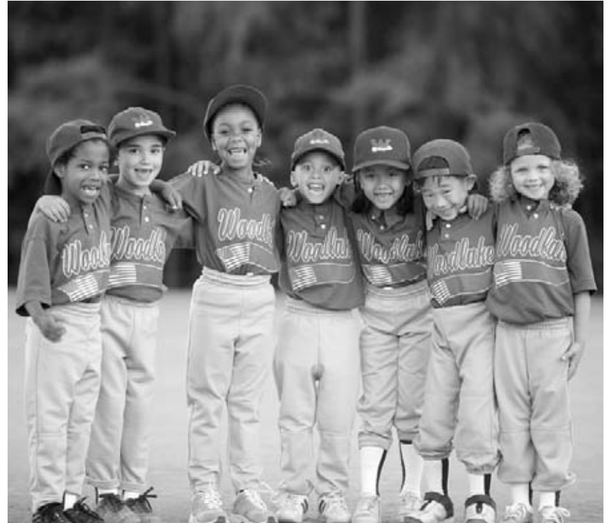
A Girls Little League team poses for a picture.

As news of the league spread, teams quickly formed all over the country. Any boy, age 9–13, could play Little League Baseball. He could be any race, religion, or color. (Girls were not allowed to play until 1974.)