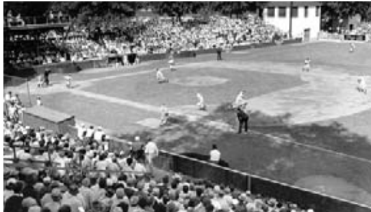
A crowd cheers during a 1955 tournament game.

In 1947, twelve teams played in the first Little League tournament that would later become the World Series. The Maynard Midgets from Williamsport beat Lock Haven Little League in the championship game. About 2,000 fans turned out, despite the August heat, and a great tradition was born.