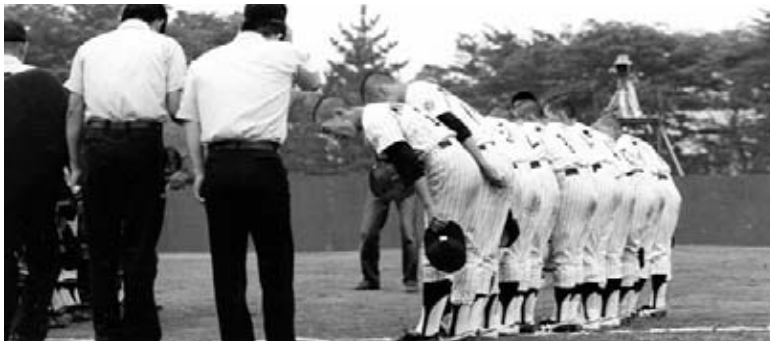
The Chinese Taipei team gets ready for a game in the mid-1980s.