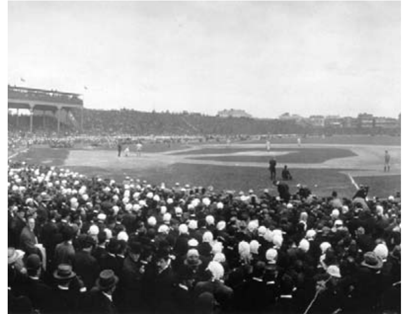
A crowd enjoys the professional baseball World Series between the Detroit Tigers and the Chicago Cubs in 1907.

In 1744, the word base-ball first appeared in print, which helps us know that the game existed at that time. Baseball became popular during the Civil War in the mid-1800s. Soldiers used it as a diversion and played it in their free time.