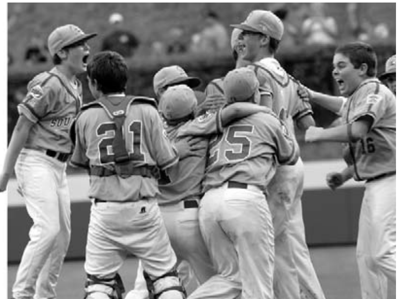
Teammates from Columbus, Georgia, celebrate their 2006 Little League World Series championship.