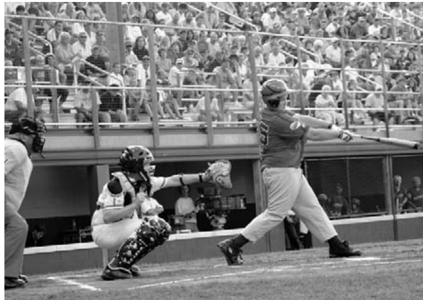
A batter from the Saudi Arabian team swings at a pitch during the teams victory over Whalley Little League in 2006's World Series tournament.

Now more than 100,000 teams compete in Little League divisions ! Different baseball divisions, such as Tee Ball, Little League, and Big League, group players by age. Little League, the most famous division, usually has teams of 11- and 12-year-old boys and/or girls. Each local Little League team is part of a district. In June, each district that is competing for a chance at the World Series picks an all-star team with no more than 14 players. To keep things fair, each player must be 11 or 12 years old on April 30 of that year. In softball, the cutoff date is December 31 of the previous year. The leagues also pick the manager and coaches for the team. In July, these teams play in many tournaments to narrow the field of competitors .